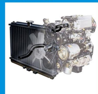
Measurement of Fluids